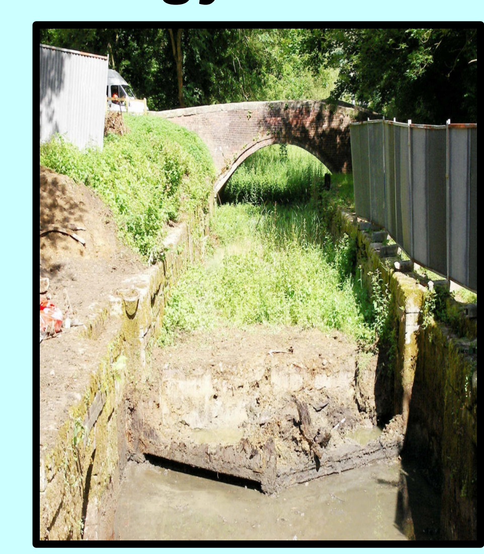
Remains of a top gate and sill